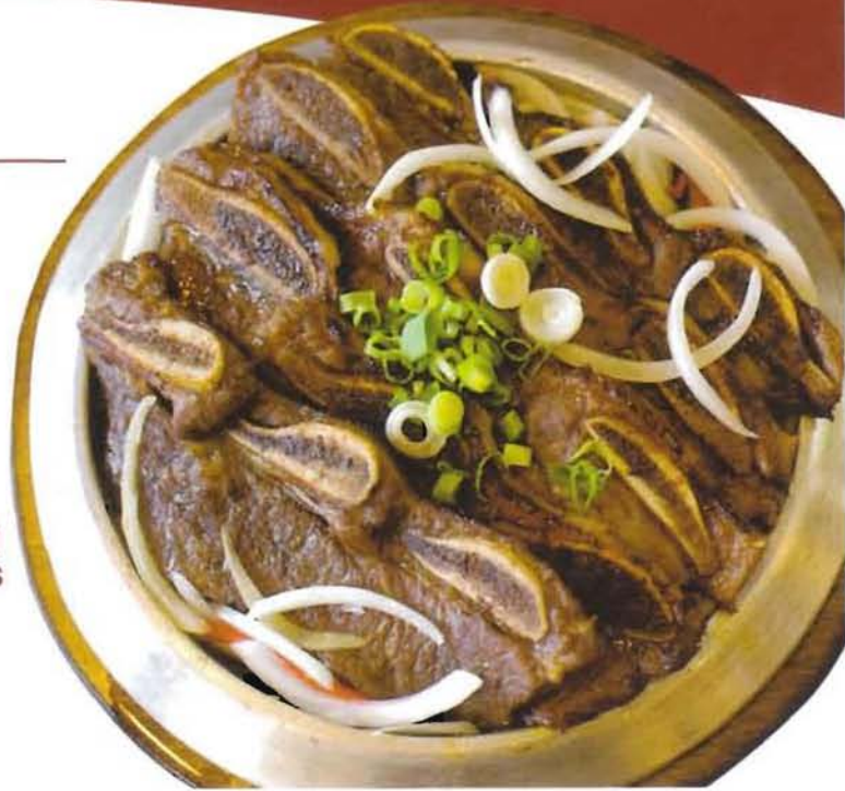
LA 갈비 BEEF SHORT RIBS